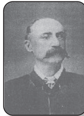
Ernest Giles was the first European to explore the George Gill Range in 1872.

The porous sandstone of the George Gill Range soaks up rainfall like a giant sponge. Water is held in the top layer of sandstone by a layer of impermeable shale immediately underlying the sandstone. Along the range are a number of places where the trapped water seeps out