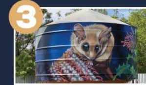
3 PYGMY POSSUM Bryan Itch