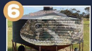
6 LINED EARLESS DRAGON Goodie