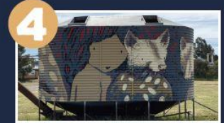
4 SPOTTED-TAILED QUOLL Kaff-iene