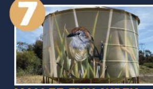
7 MALLEE EMU-WREN Jimmy Dvate