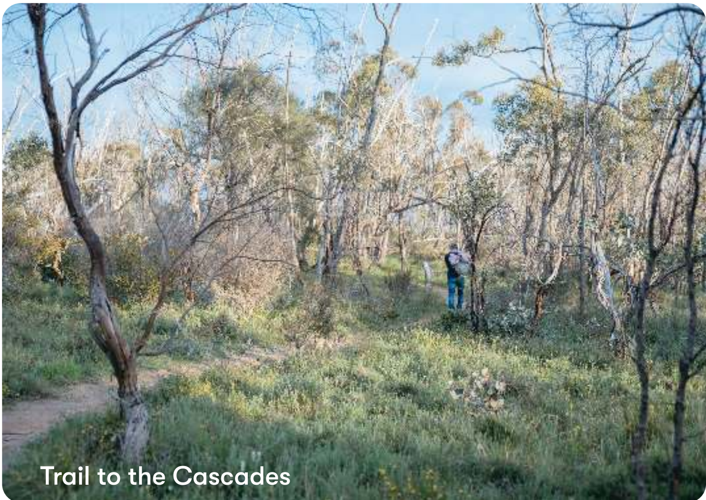
Trail to the Cascades

• Spring Gully Conservation Park is closed on days of Catastrophic Fire Danger and may be closed on days of Extreme Fire Danger. Check the CFS website www.cfs.sa.gov.au or call the CFS Hotline 1800 362 361 .