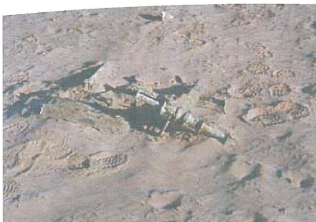
Remnants of Wirraway parts found at the Lake

Because of the critical need to continue Lake Victoria water storage operations, the MDBA (the then MDBC) applied to the Director-General of the NSW NPWS, now OEH, in April 1998 for consent to "destroy, deface or damage an Aboriginal relic/place under Section 90 of the NSW National Parks and Wildlife Act, 1974" and a Permit to disturb relics under Section 87 of the Act.