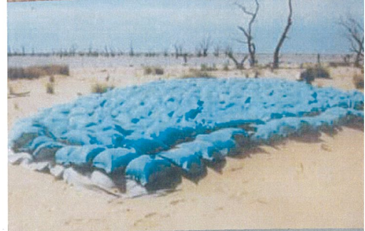
Top: Lake Victoria outlet – 17 June 1928: courtesy SA Water Middle: Grindstones found on the Lakeshore: courtesy Jeannette Hope Bottom: Burial mound on Moon Island: courtesy Jeannette Hope