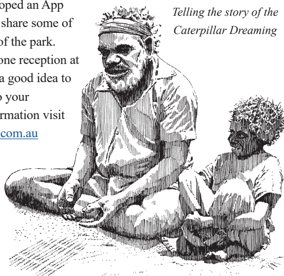
Telling the story of the Caterpillar Dreaming