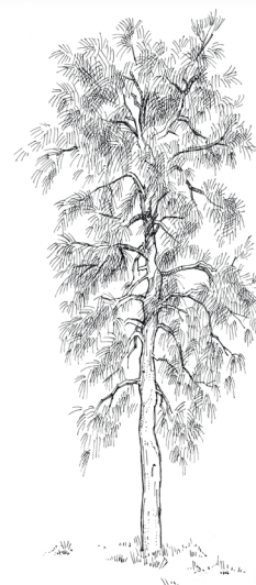
Peuce is a Greek word meaning pine