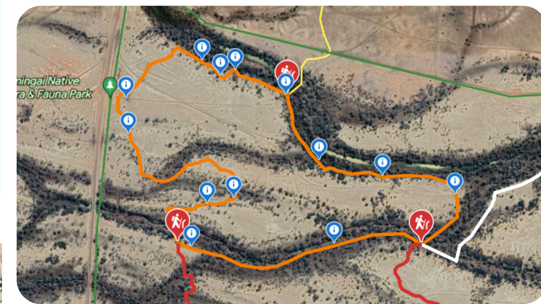
Coolibah Loop 3.7km