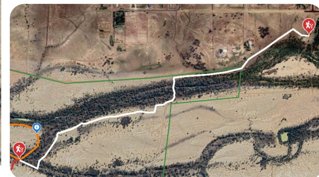
Gidgee Track 2.41km