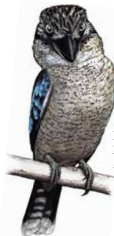
Blue-winged Kookaburra Dacelo leachii