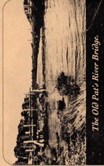
The Old Pat's River Bridge.

The bridge was burned in about 1907, then patched up until a new bridge was built at the present site near the entrance to the Whitemark aerodrome.