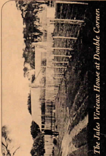
The Jules Virieux House at Double Corner.