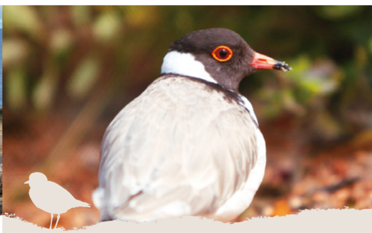
Hooded Plovers nest on the upper beach in summer. Look out for them and give them space.