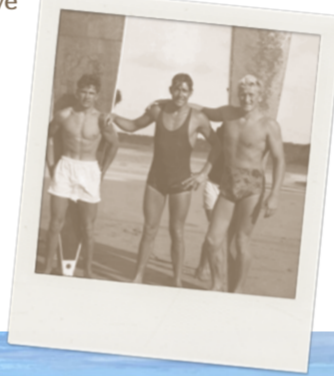
Lookout, Aireys Inlet

The Split Point Lighthouse guides visitors to the western end of the Walk past Aireys Inlet, a small coastal village with soul. The pub and local eateries have great views of the local terrain and the western end of the Walk at Fairhaven.