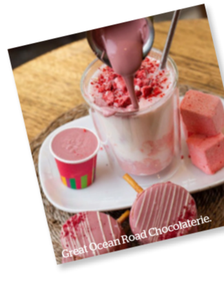
Great Ocean Road Chocolaterie