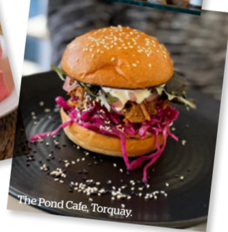
The Pond Cafe, Torquay