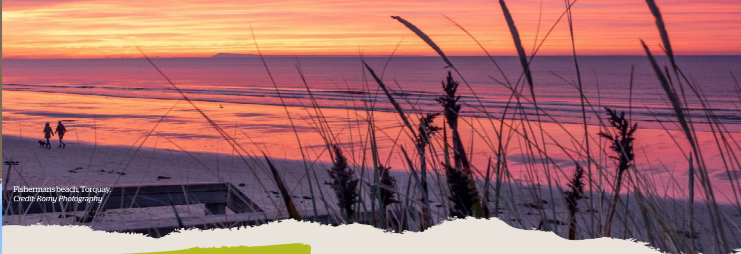
Fishermans Beach, Torquay