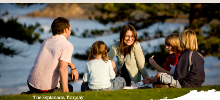
The Esplanade, Torquay

The Surf Coast Walk spans the traditional lands of the Wadawurrung People. We acknowledge them as the Traditional Owners of this land and pay respect to their Elders: past, present and emerging.