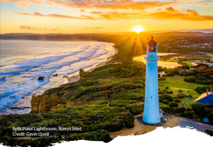
Split Point Lighthouse, Aireys Inlet

Accessibility: Only concrete paths in central Torquay and Anglesea meet wheelchair standards, but most Grade 2 tracks are flat, smooth and step free. An All Terrain Wheelchair is available for hire. (See reverse for details).