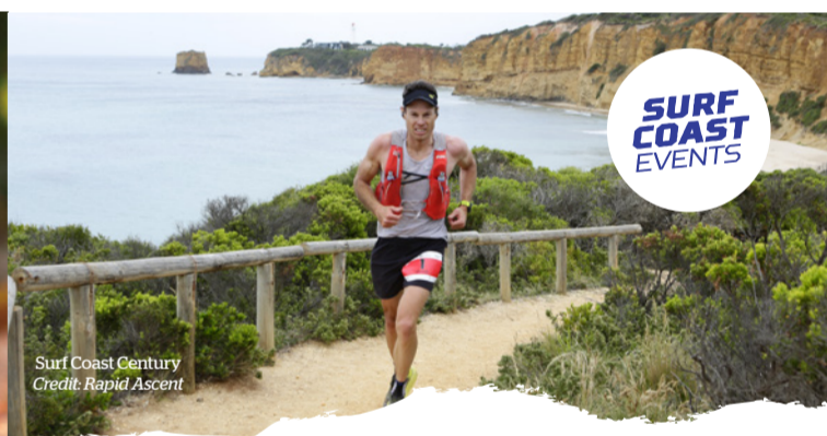
Surf Coast Century