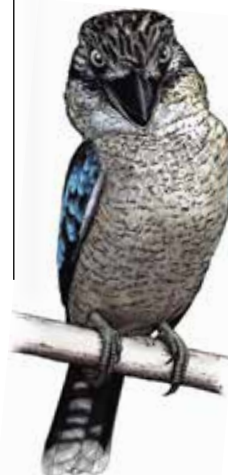
Blue-winged Kookaburra Dacelo leachii