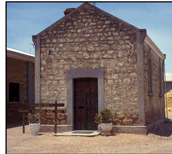
Original Council Chambers, opened 1895

Locate and read the " Town Administration " sign.