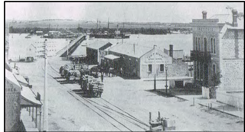
View from Darling's Flour Mill looking west along Bay Street c1912 The 2 storey Institute is on the right hand side of the photograph