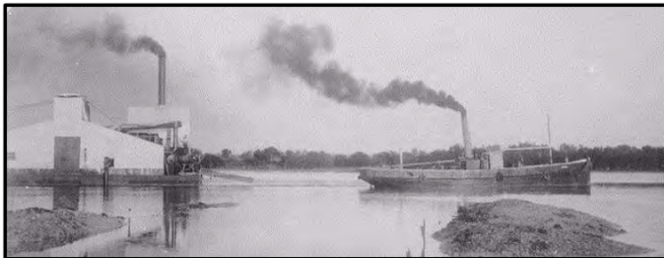
Marine Fibre works at Port Broughton c1913

In 1911 a Marine Fibre plant began operating. Fibre in its cleanest state was required for mixing with wool for outer wear. It was also made into tweeds and worn as suits, but did not prove very successful. It was also used for mattress making and upholstery. Its greatest success was a non-conductive covering on boilers and hot water installations. The operation was financially unsuccessful and closed in 1917.