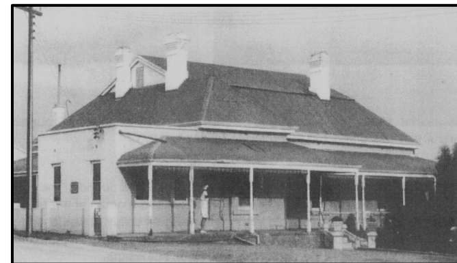
The Original Hospital opened in 1915. It was demolished in 2017