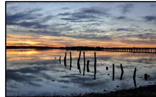
The remains of the first jetty.