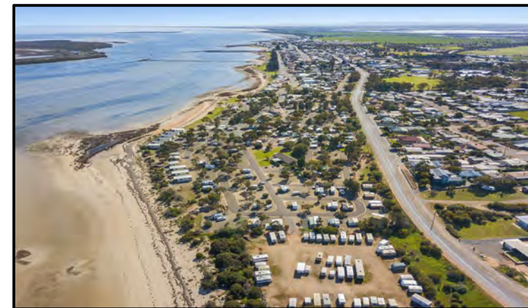
Aerial View of Port Broughton