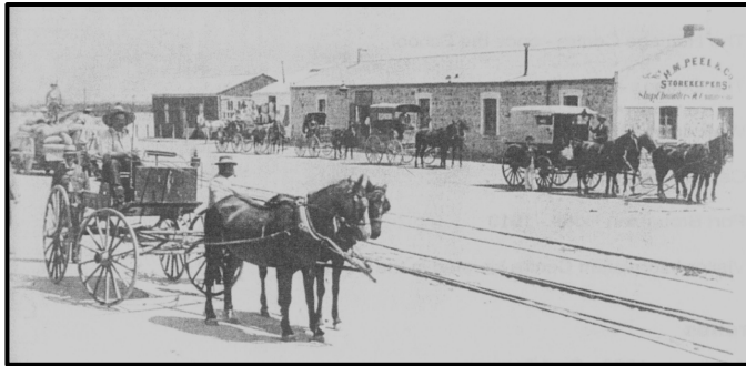
Port Broughton in c1882 showing Peel's Butter Factory

Around 1880 H M Peel & Co opened a grocers shop in the main street which served the district for many years. A butter factory and an ice manufacturing business also operated on the same site.