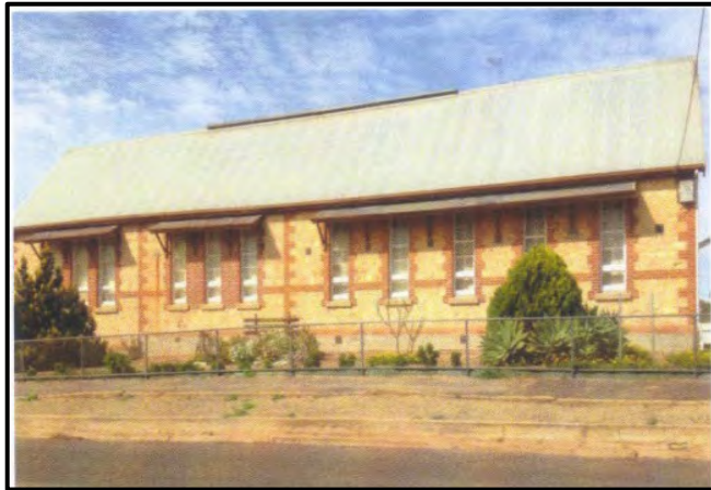
The Heritage Centre which was the original school

Locate and read the "Early Education" sign.