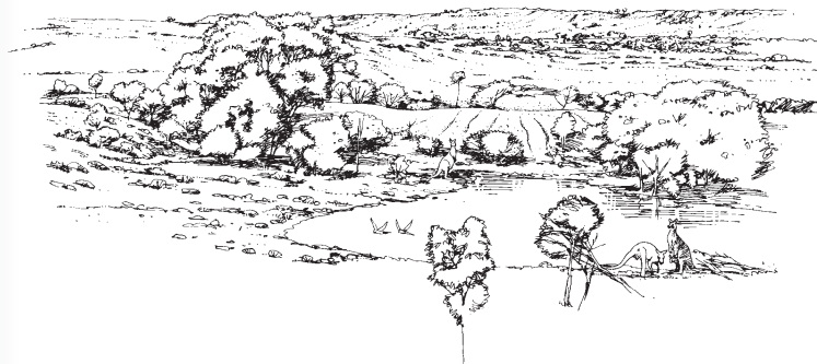
The sharp outlines of the craters have been softened over thousands of years by wind and rain to become the broad undulating mounds that you see today.