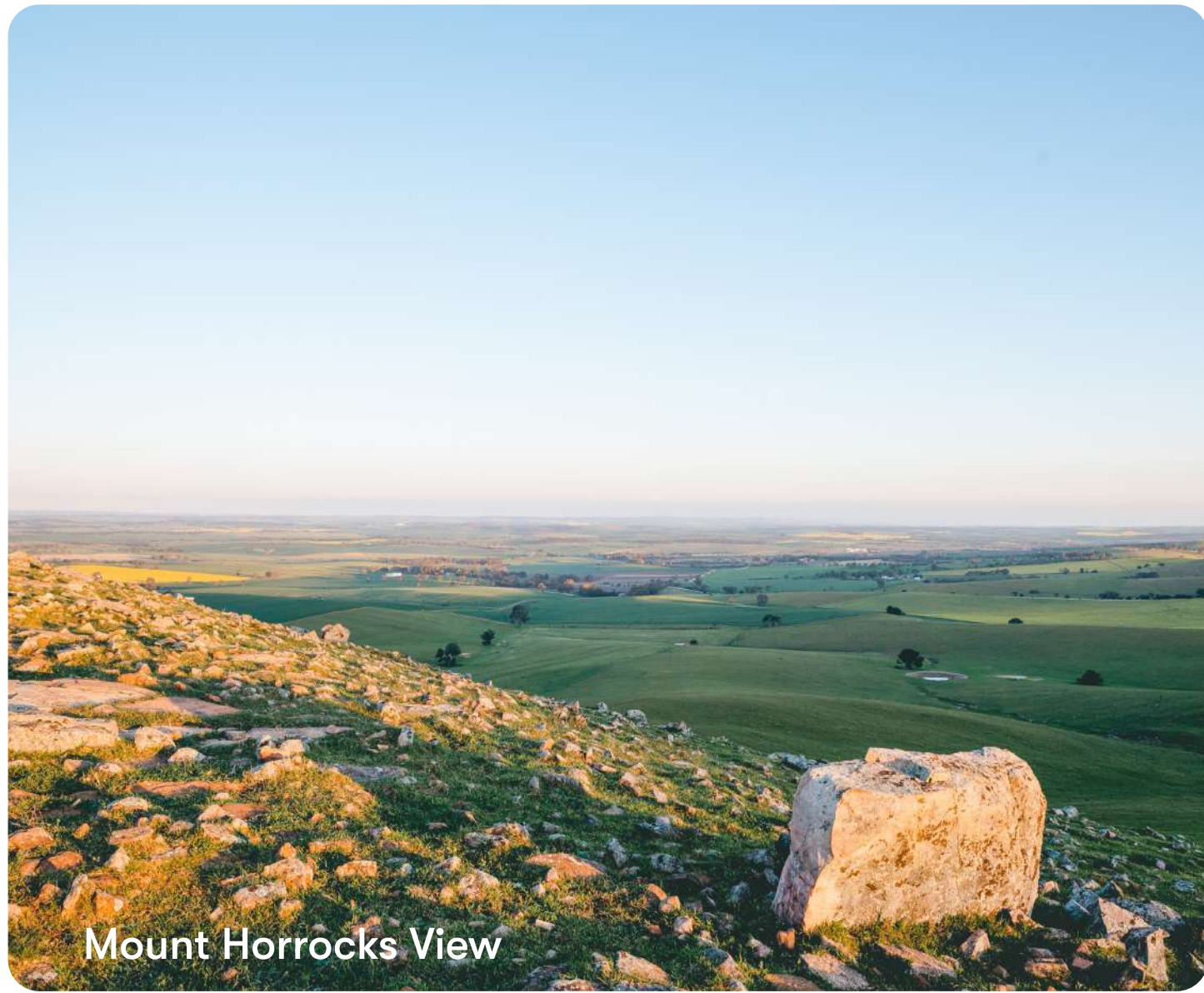
Mount Horrocks View

Immerse yourself in the scenic Watervale region, well known for its world class Riesling. Walk through the historic township of Watervale into classic Clare Valley countryside of vineyards, cellar doors and rolling hills as you make your way to the Mount Horrocks lookout to enjoy the spectacular 360 degree views; some of the best in the region. This walk predominantly follows the Lavender Federation Trail and includes back roads which take you onto private property with a climb up to Mt Horrocks lookout. Unfortunately you don't climb Mount Horrocks itself but the view is no less spectacular from the top!