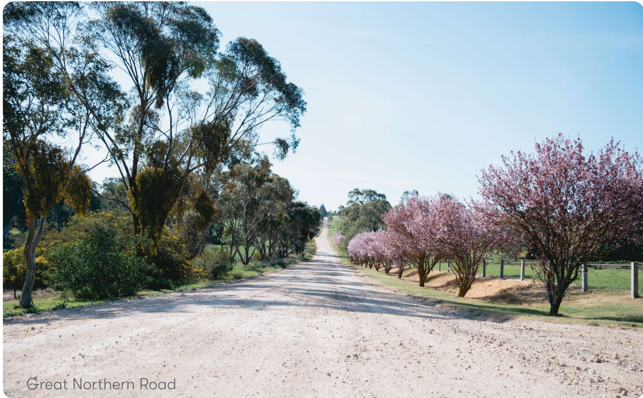
Great Northern Road