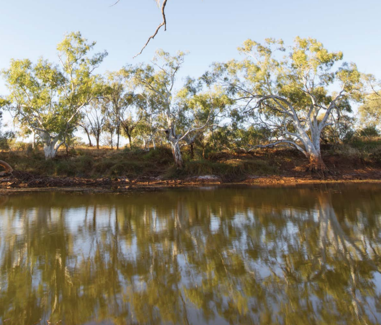
Above Cattle Pool.