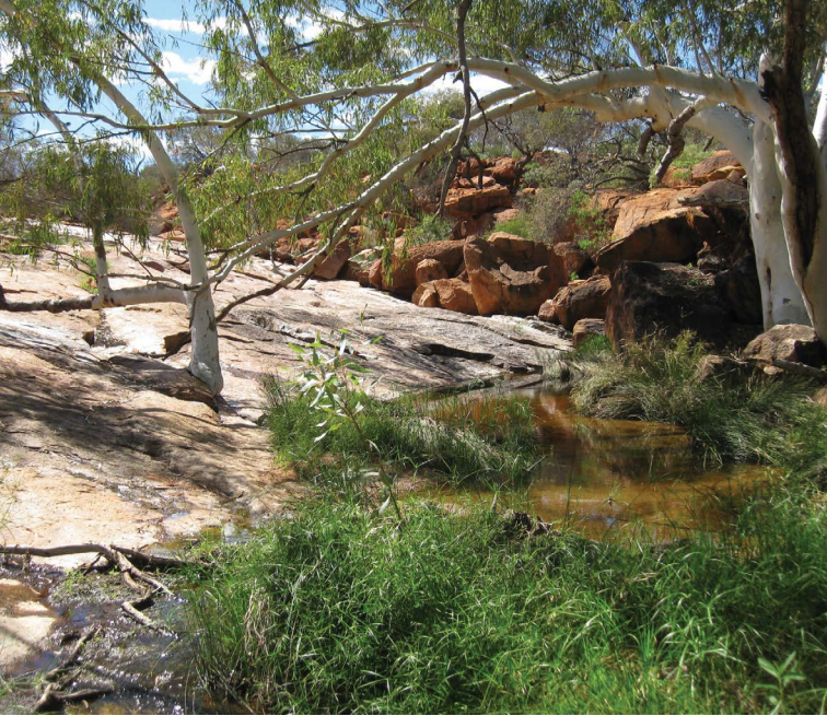
Above Edney's Spring.