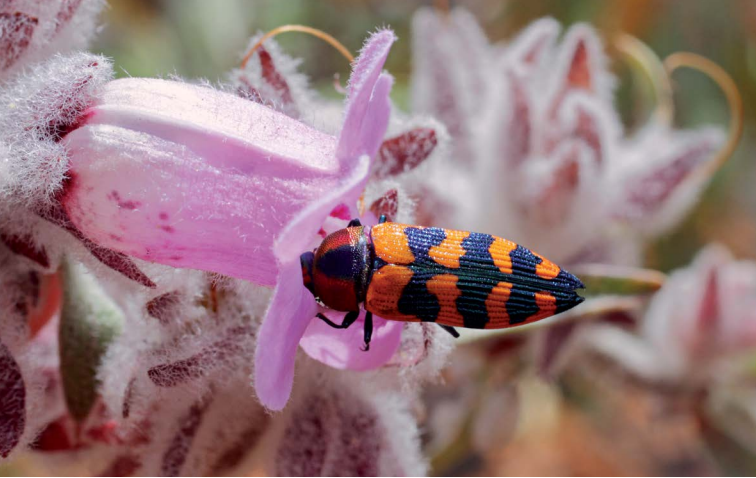
Above Mount Augustus foxglove and jewel beetle.