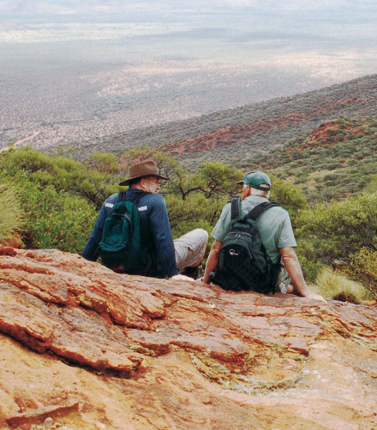
Above Hikers admiring the view from the Summit Trail.