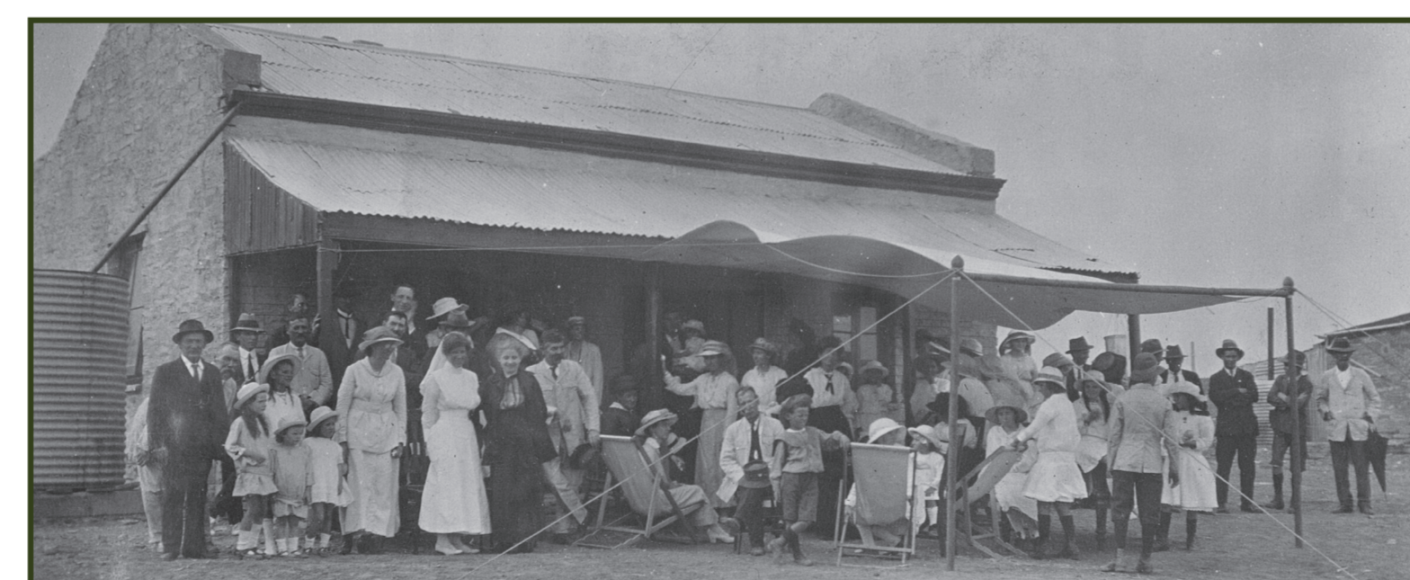
The renovated Smith of Dunesk house opening as the Australian Inland Mission's 'Mitchell Home', a nursing home, in 1919