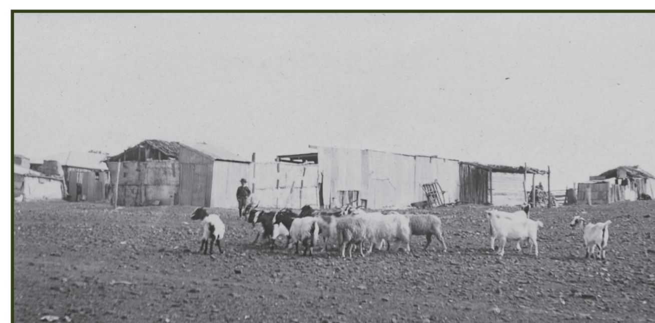
Wood's Goats at Beltana, 1897 State Library of South Australia – PRG 1610/11/88