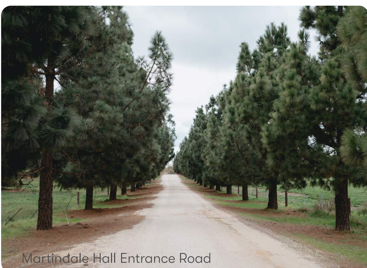
Martindale Hall Entrance Road