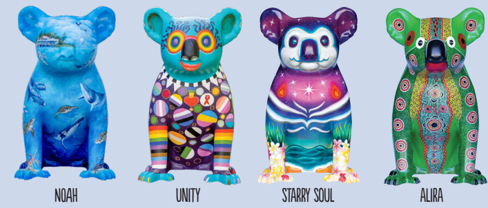
NOAH UNITY STARRY SOUL ALIRA