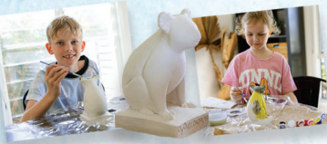
Paint Your Own Hello Koalas Plaster