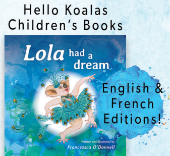
Hello Koalas Children's Books Lola had a dream English & French Editions!

Visit Hello Koalas Sculpture Gallery & Gift Shop NEW ADDRESS Unit 2/1a Blackbutt Road, Port Macquarie - just near Lake Road in the industrial estate Email info@hellokoalas.com Enquiries 0416 641 482 Open Mon-Fri, 9am to 4pm