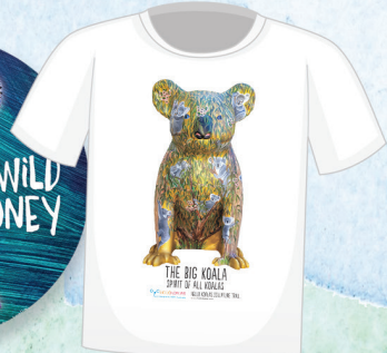
Tshirts & Totes