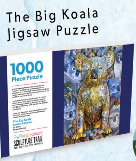
The Big Koala Jigsaw Puzzle