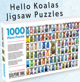
Hello Koalas Jigsaw Puzzles

Discover a fascinating array of Hello Koalas bespoke merchandise including magnets, badges, T shirts for adults and kids, jigsaw puzzles, T towels, tote bags, aprons, stickers, notebooks, lens cloths, postcards and the largest selection of koala themed toys, home accessories, babywear and unique gifts & artworks.