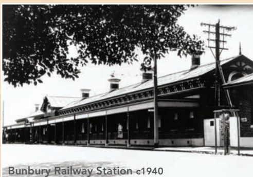
Bunbury Railway Station c1940

Watch a steam engine demonstration, explore a replica mine and walk the longest wooden pier in the southern hemisphere. It's all part of Working Life, your passport to the past.