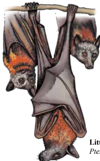
Little-red Flying-fox Pteropus scapulatus

Walking - follow the river bed downstream. The fallen timber in the river bed is evidence of powerful wet season floods.